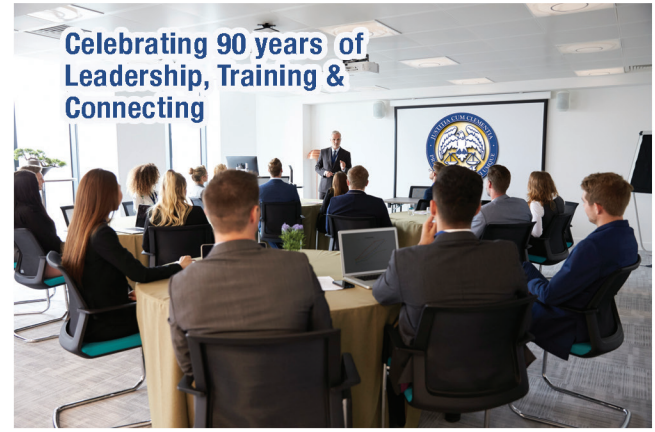
Doubletree by Hilton Hotel, Ontario Airport Ontario, CA